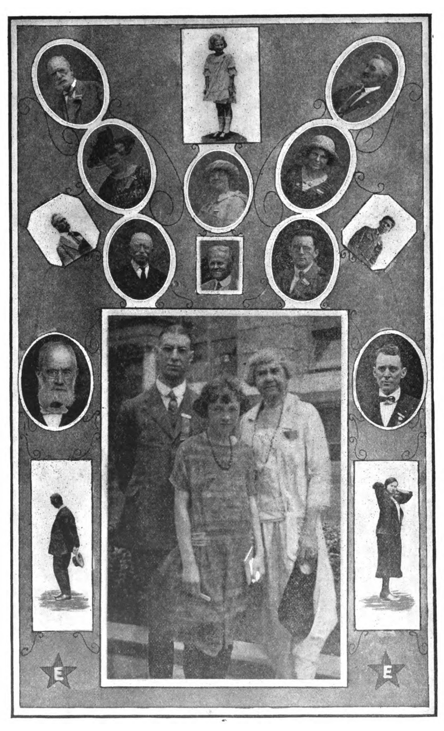
"The Trio" and some Congressional vignettes.