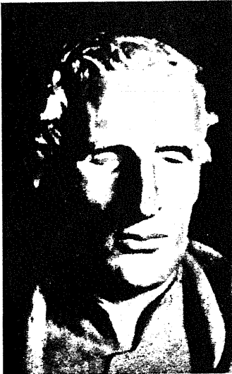
Louis Braille. 1809 - 1852

Tiun edukon komencis Valentin Haüy en la jaro 1783, kiam li fondis en Parizo la Instituton Nacian de Junaj Blinduloj. Haüy edukis per alfabeto de grandaj levitaj li-