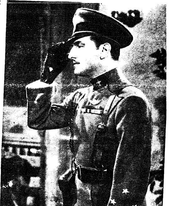
Captain Joseph Shildkraut commands troops in film "Idiot's Delight", using the Esperanto language.